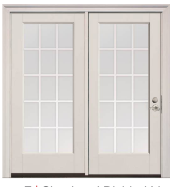
Low-E | Simulated Divided Lites